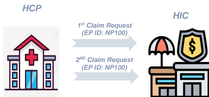
Figure 2 Adding Additional Services through New Claim Submission

If the provider wanted to add more items/services in the claim request, then the provider can create a 2 nd claim request and link it with the same episode ID of the 1 st claim request. This will be considered a new claim, not re-submission.